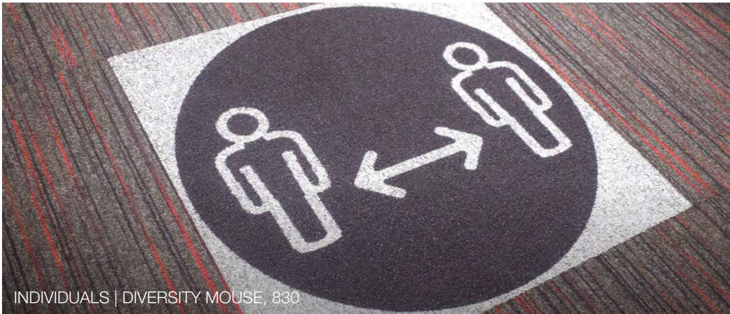
INDIVIDUALS | DIVERSITY MOUSE, 830