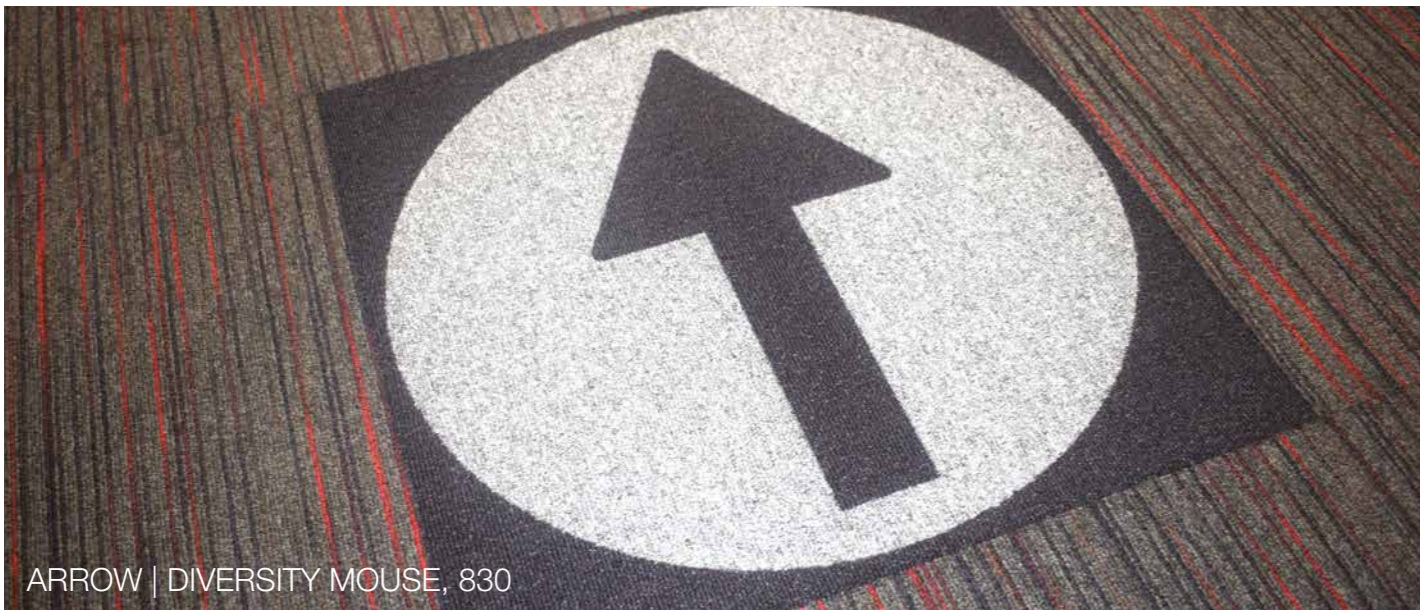
ARROW | DIVERSITY MOUSE, 830