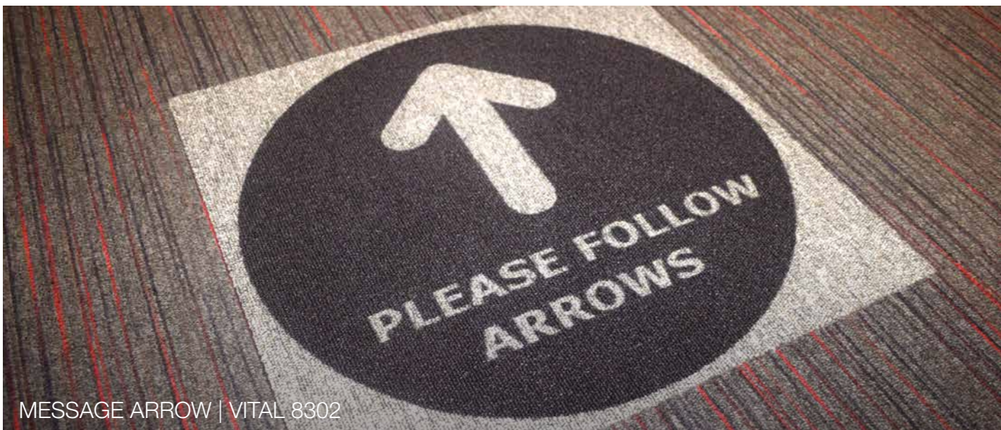
MESSAGE ARROW | VITAL 8302