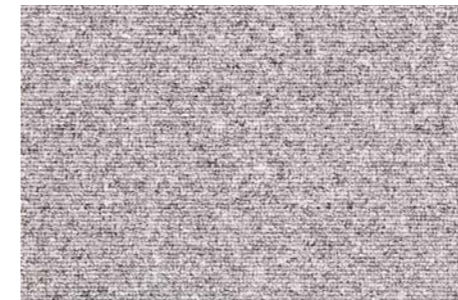
Diversity Mouse, 830